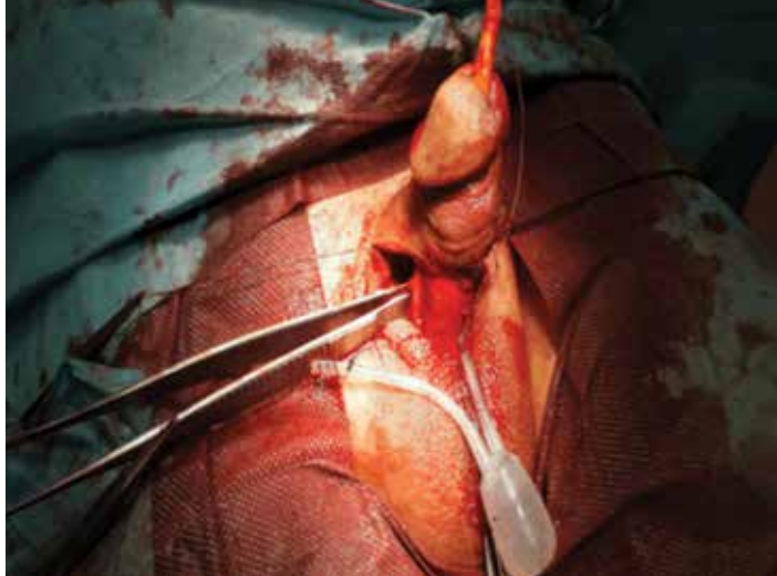
Figure 3. One piece of the prosthesis formed with the help of hemoclips by cutting the intracavernosal septum was implanted into the penis