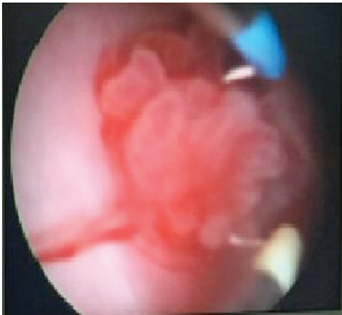
Figure 1. Cystoscopy of the bladder. Papillary tumor is seen attaching to the right lateral wall of the bladder

Bladder tumor is rare in children and young adults and the peak incidence is in the sixth decade of life (1). Series of transitional cell tumor of the bladder in young patients are limited in the literature. In a study by Aboutaieb et al. (2) including 26 patients,