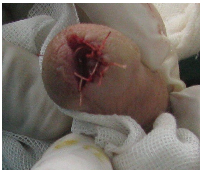
Figure 2. Postoperative appearance

poor urinary flow (2). Vecchioli Scaldazza (6) reported a case of urinary retention due to a PUC in a 17-year-old female patient. Although PUC gives an impression that it might have an effect on urination, most patients are asymptomatic. Like most of the other cases, our patient wanted to undergo a surgical excision due to cosmetic reasons.