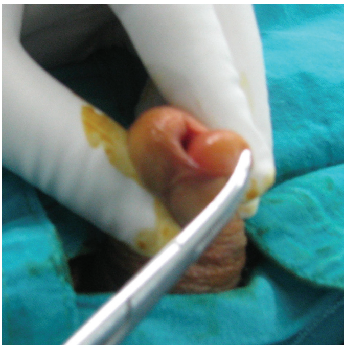
Figure 1. Preoperative appearance

literature about this condition. The largest series is published by Willis et al. (1) in 2011 which reported 18 pre-pubertal boys. Other than this series, Shiraki (4) reported 9 cases in 1975. After these two big series, cases of 3-4 patients have been reported in the English literature and, in Japanese literature, this entity has been reported more frequently (5). The reported cases were covering an age distribution ranging from infancy to puberty and no associated urological abnormalities were recognized. On examination of the urinary system, no abnormality was detected in our patient. Very few patients were symptomatic and the symptoms include decrease in caliber of the urine stream and