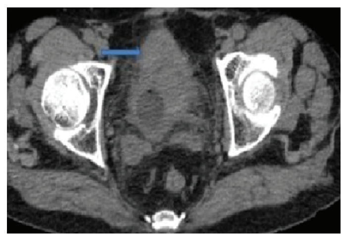
Figure 1. Ectopic prostate originating from front wall of the bladder-radiological view