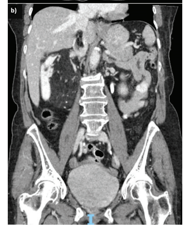
Figure 1. a) CT venous phase axial view demonstrating right renal tumor with venous extension, b) CT venous phase coronal view