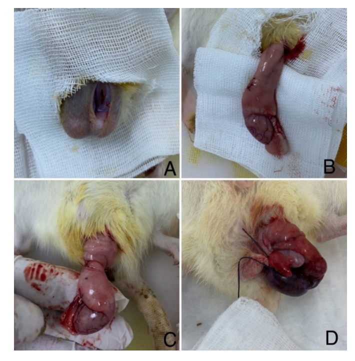
Figure 2. Surgical Procedure A. Midline scrotal incision, B. The left testicle was released from the gubernaculum, C. Twisting testicular cord 720 ^{\circ} C in a clockwise direction, D. The torsion position was maintained by fixing the testicle to the scrotum with a 4-0 silk suture

The tissue samples of each rat were fixed in 10% neutral formaldehyde and then the testis was sampled by the pathologist, including the largest surface from the middle. Each tissue was prepared as 5-µm sections from each paraffin block and stained with hematoxylin-eosin (H-E). Seminiferous tubule diameters, epithelial lengths (EL) and Johnsen testicular biopsy scores were calculated. Mean seminiferous tubule diameter