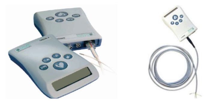
Figure 1. Orion II<sup>™</sup> ambulatory pH recorder (Medical Measurements System, Enschede The Netherlands)

Nocturnal pH monitoring was performed in an ambulatory manner using an Orion II<sup>™</sup> recording device [Medical Measurements Systems (MMS), Enschede, The Netherlands USA] and single crystal antimony pH catheters (Synectics Medical, Sweden) (Figure 1). This device is commonly used for diagnosis of gastroesophageal reflux. All measurements were done at the volunteers' home. The catheters were calibrated with solutions having pH 1 and 7 before each recording. All volunteers were educated for the placement and fixation of the catheter and for the operating procedures of Orion II. The pH catheters were marked with a water-resistant marker from 7 cm of the tip. The volunteers placed the pH catheters inside their vagina till to marker on the catheter just before night sleep. The mark on the pH catheters guaranteed as the active point of the catheter