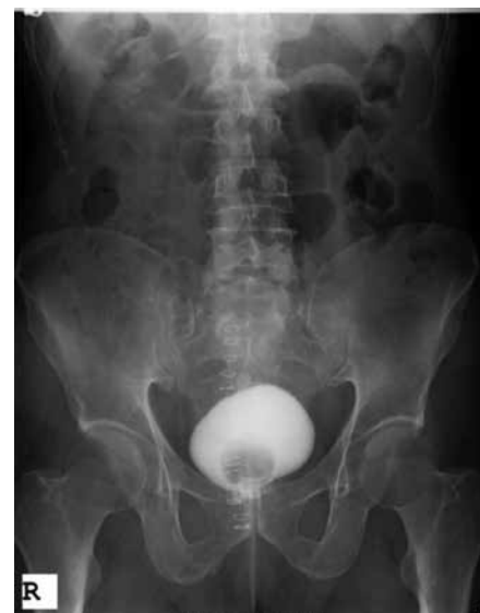
Figure 3. Cystogram image of post-operative on day 10